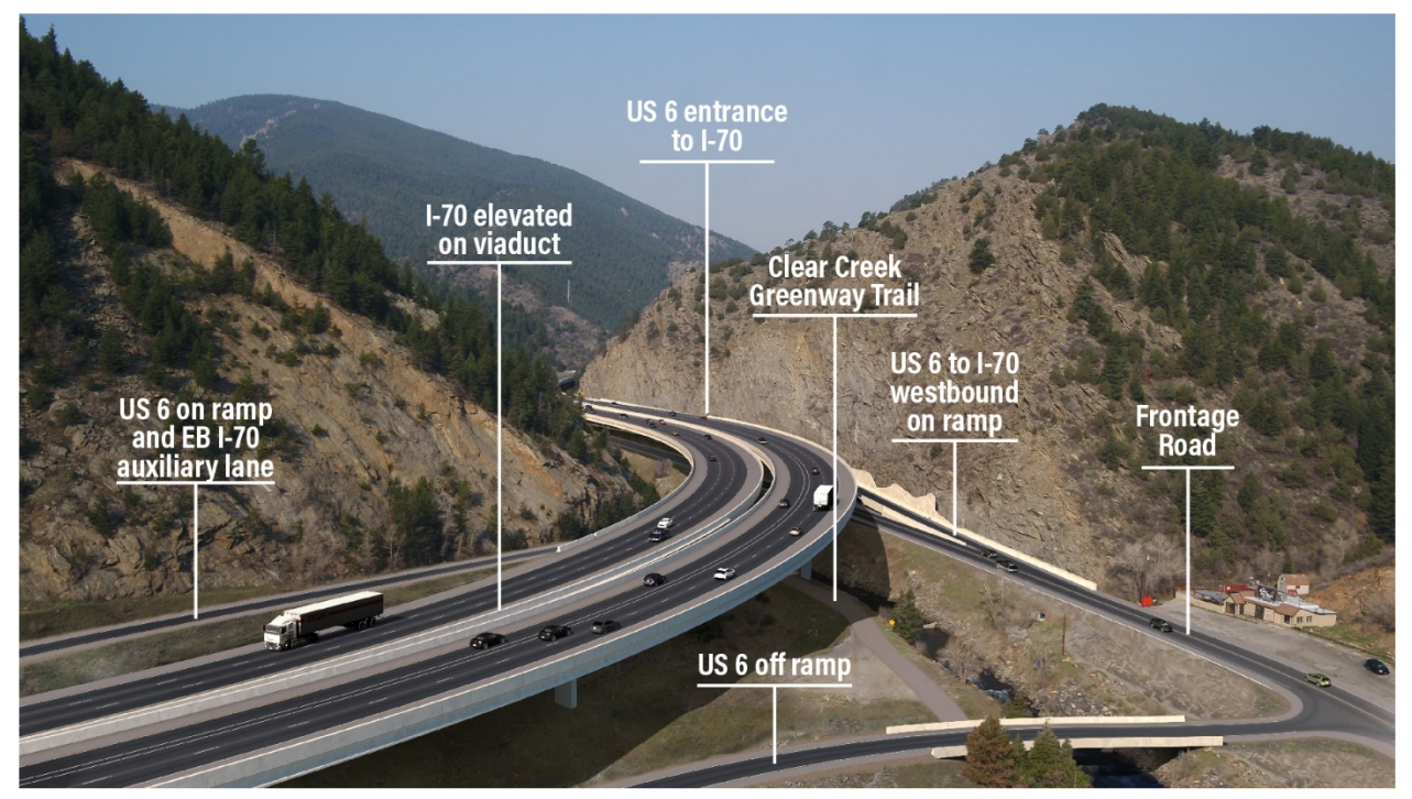
The Canyon Viaduct, simulated above, would realign a portion of WB and EB I-70 between US 6 and Hidden Valley to the south on a viaduct (bridge) structure above the Clear Creek Canyon, similar to I-70 through Glenwood Canyon. Moving the interstate out of the floor of the narrow canyon provides space for the new frontage road connection and Clear Creek Greenway and facilitates Clear Creek riparian restoration that enhances water quality, recreation, and wildlife habitat. Elevating the highway and moving it farther from the canyon walls also reduces the potential for mudslides and rockfall to interfere with highway operations.

charging stations--that support the ways travel can and will change in the future. It also includes new air quality monitors and provides a redundant route for when natural disasters disrupt highway travel. Impacts to high-quality wetlands and wildlife habitat have been avoided while important riparian areas of Clear Creek will be restored; improving water quality, wildlife habitat, and prized fishing and rafting areas. Lastly, the Project will construct the Corridor's first major wildlife crossings.